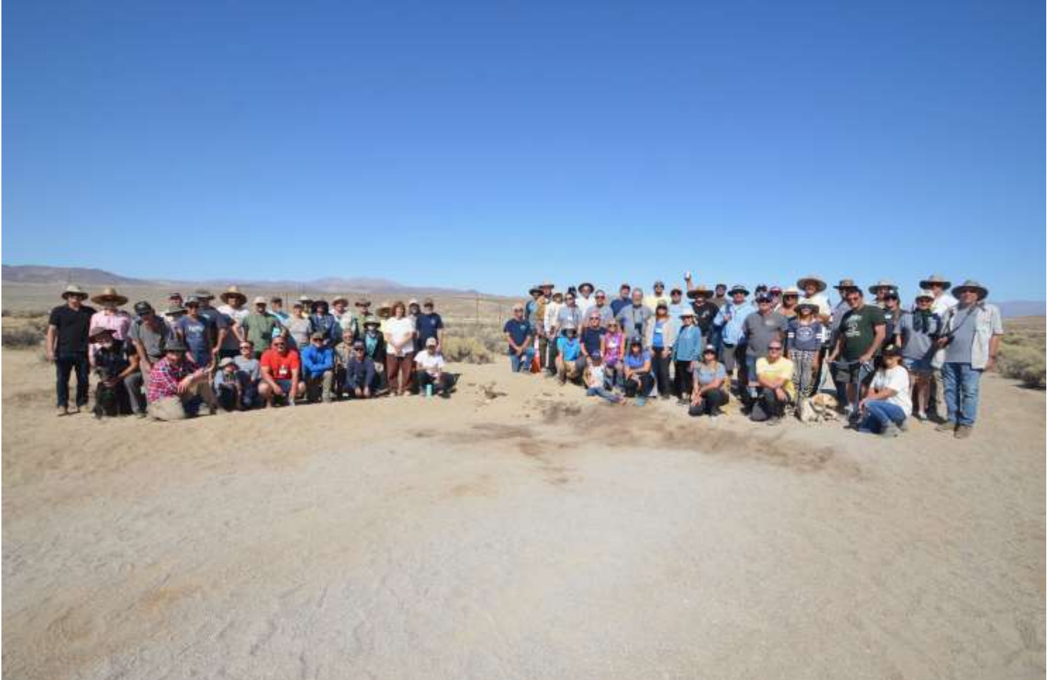
Photo of the SDAG 2019 Owens Valley Field Trip group standing on and perpendicular to the 7.1 Ridgecrest Earthquake fault scarp.

If you would like to submit a photo, email them to secretary@sandiegogeologists.org and I will try and put them in the newsletter. Provide a short description of the picture.