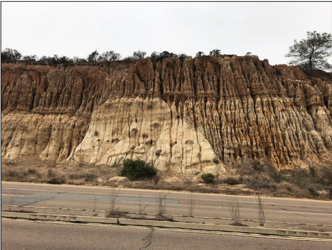
Torrey Pines LV with Natasha Rodriguez (9) big concretions in Torrey Ss