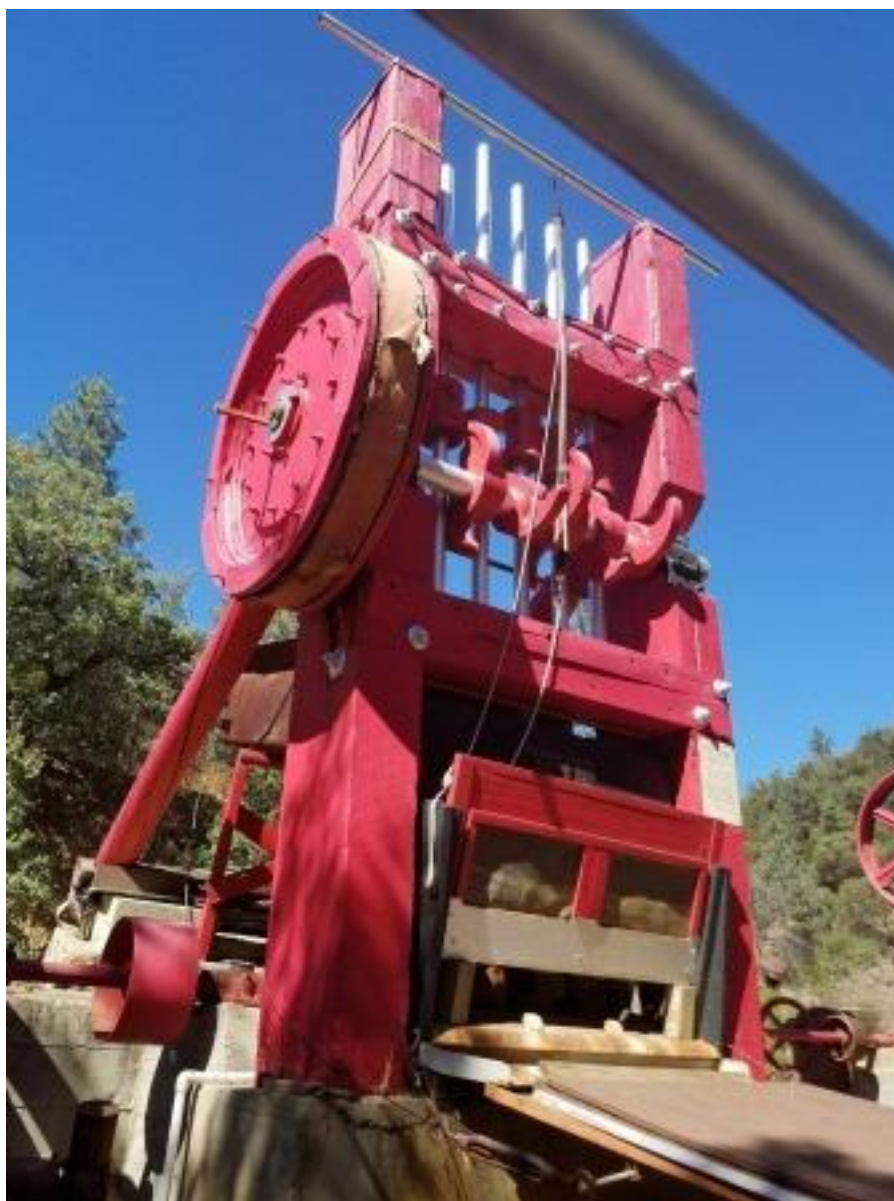
Five Stamp Mill – Eagle Mine in Julian.

If you would like to submit a photo, email them to secretary@sandiegogeologists.org and I will try and put them in the newsletter. Provide a short description of the picture.