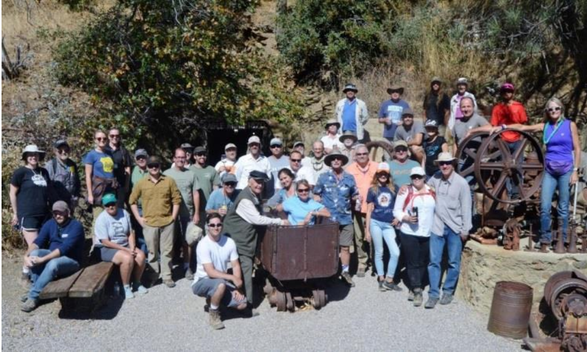
2017 SDAG Field Trip Participants at the Eagle Mine, Julian, CA