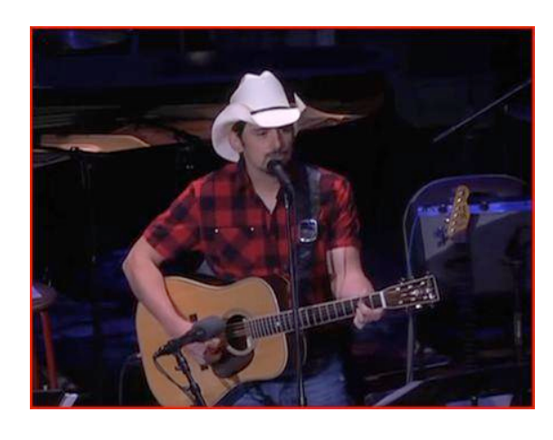
http://www.youtube.com/watch?v=qF0iC6DXMQ8 "Your substrata makes my lava flow."