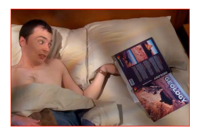
http://www.youtube.com/watch?v=aOQp3FHOPyQ The Kardashians of Science?!?