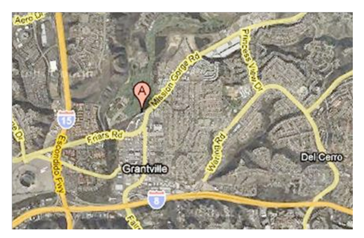
RESERVATIONS CANNOT BE GUARANTEED AFTER MONDAY AT 12 NOON BUT THEY ARE ALWAYS PREFERRED OVER WALK-INS