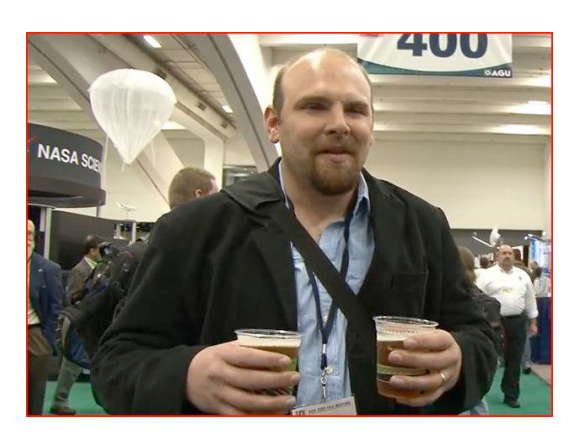
http://www.youtube.com/watch?v=q29578ZF_7o ..because I like free flow of information (or I hate lines), I double fist.