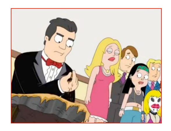
http://www.youtube.com/watch?v=DWiIIhAh2-U We all know that the good geotechs need only pinch the soil

Hello there SDAG. Another successful field trip this past month! I hope everyone on it had a great time. I've decided to take a little different angle on this month's "Corner". Since to be reading this newsletter, you should be sitting at a computer, and certainly have some time on your hands, here are some youtube links I've stumbled over in the past year that poke some fun, and are worth sitting past the preliminary advert. If you've already seen all of them, I apologize, but you should probably get off the computer and go get some exercise: