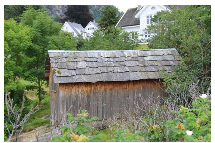
Slate roof on shed, Norway