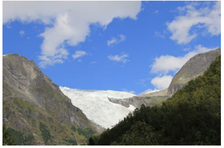
Boyabreen Glacier, Norway