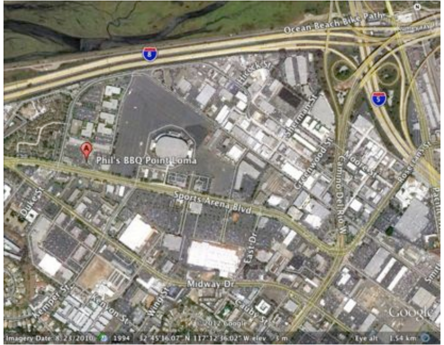
RESERVATIONS CANNOT BE GUARANTEED AFTER FRIDAY AT 12 NOON, BUT THEY ARE ALWAYS PREFERRED OVER WALK-INS

Reservations: Make your reservation <u>online</u> at <u>www.sandiegogeologists.org</u> no later than noon, Friday, November 15th.