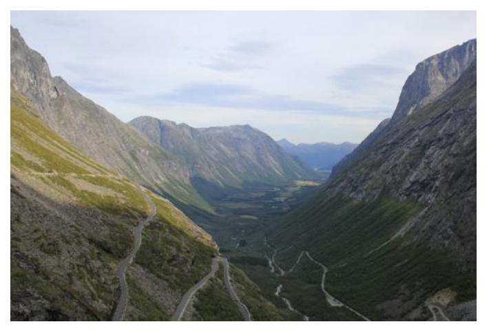
U-shaped glacial valley, Trollsteigen Hwy, Rauma, Norway