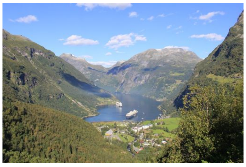
Gerainger Fjord, UNESCO World Heritage Site, Norway