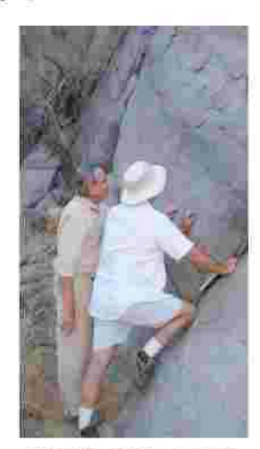
Getting one's nose up to the rocks!