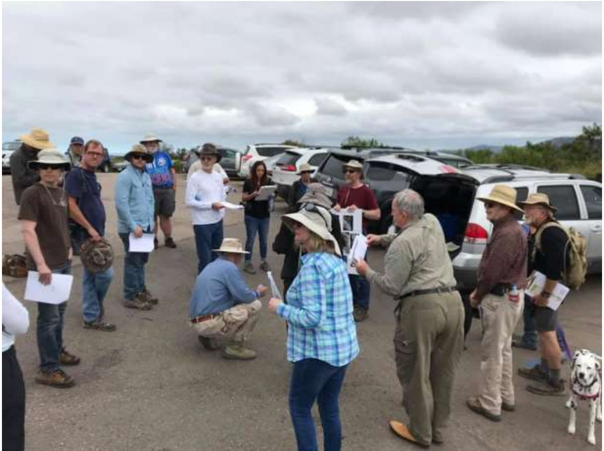
Photo of our June OSW at Miner's Ridge Trail.

If you would like to submit a photo, email them to secretary@sandiegogeologists.org and I will try and put them in the newsletter. Provide a short description of the picture.