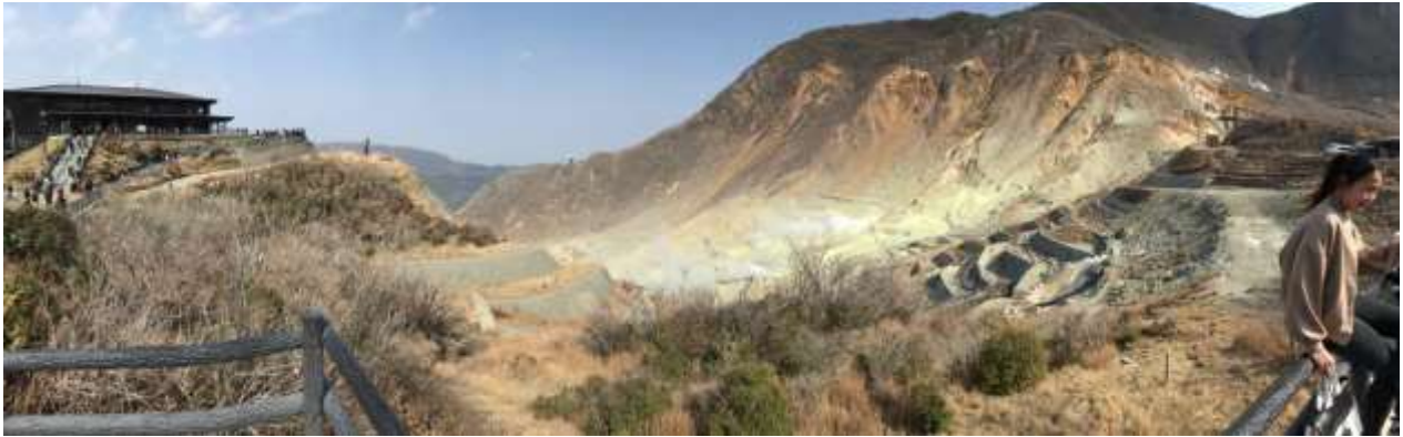
Hakone Volcano, Owakudani, Japan

If you would like to submit a photo, email them to secretary@sandiegogeologists.org and I will try and put them in the newsletter. Provide a short description of the picture.